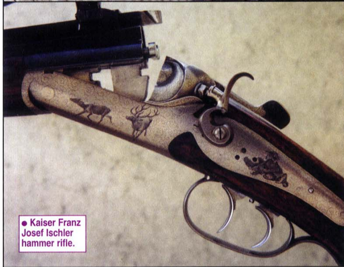
● Kaiser Franz Josef Ischler hammer rifle.